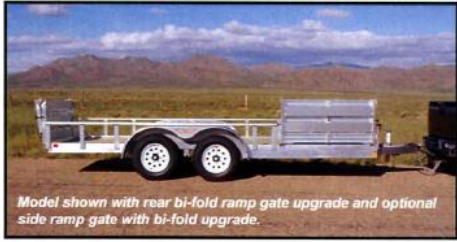
Model shown with rear bi-fold ramp gate upgrade and optional side ramp gate with bi-fold upgrade.