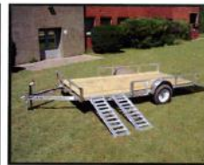
Side Ramp Gate